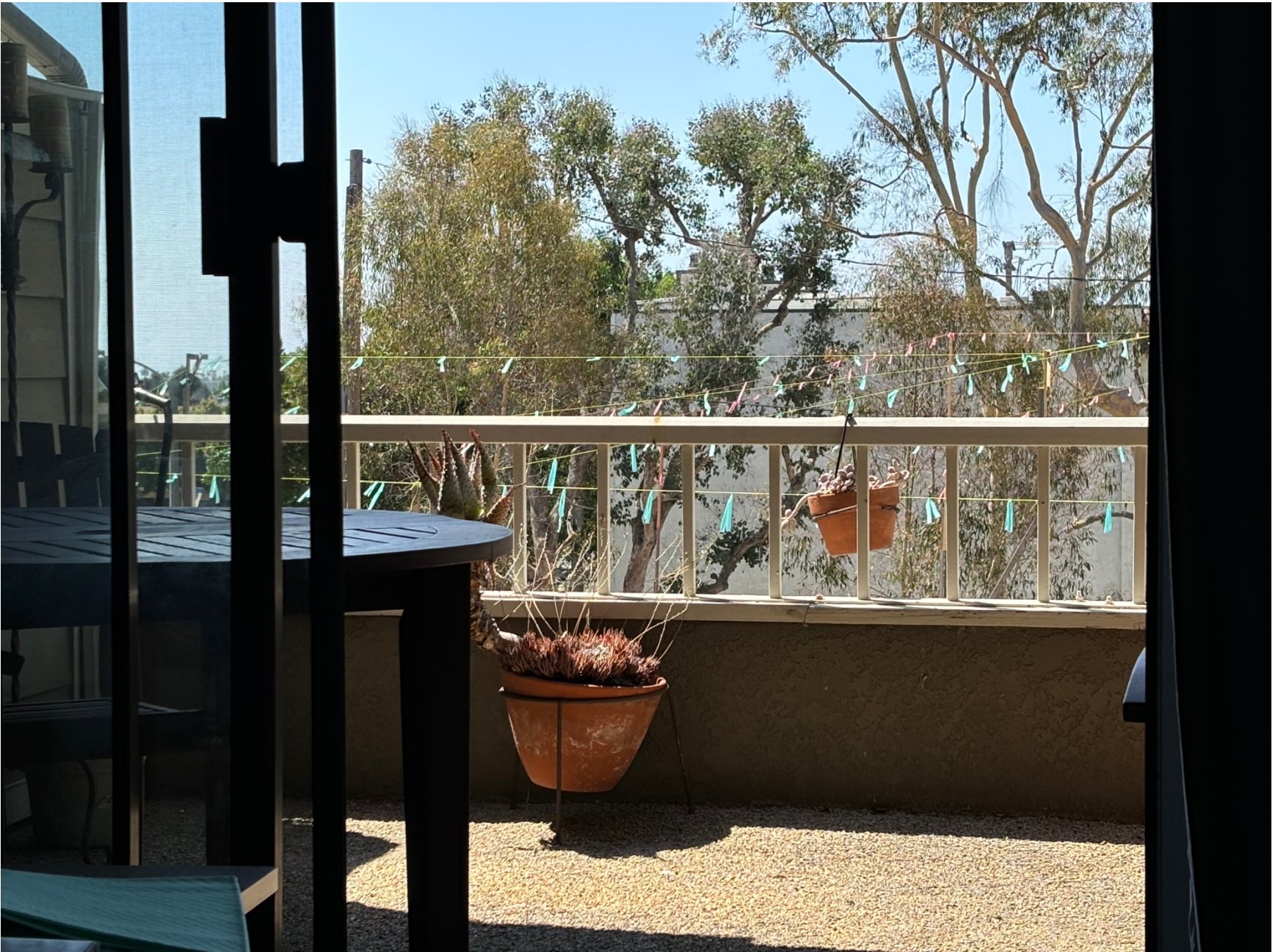
Living Room (sitting down)