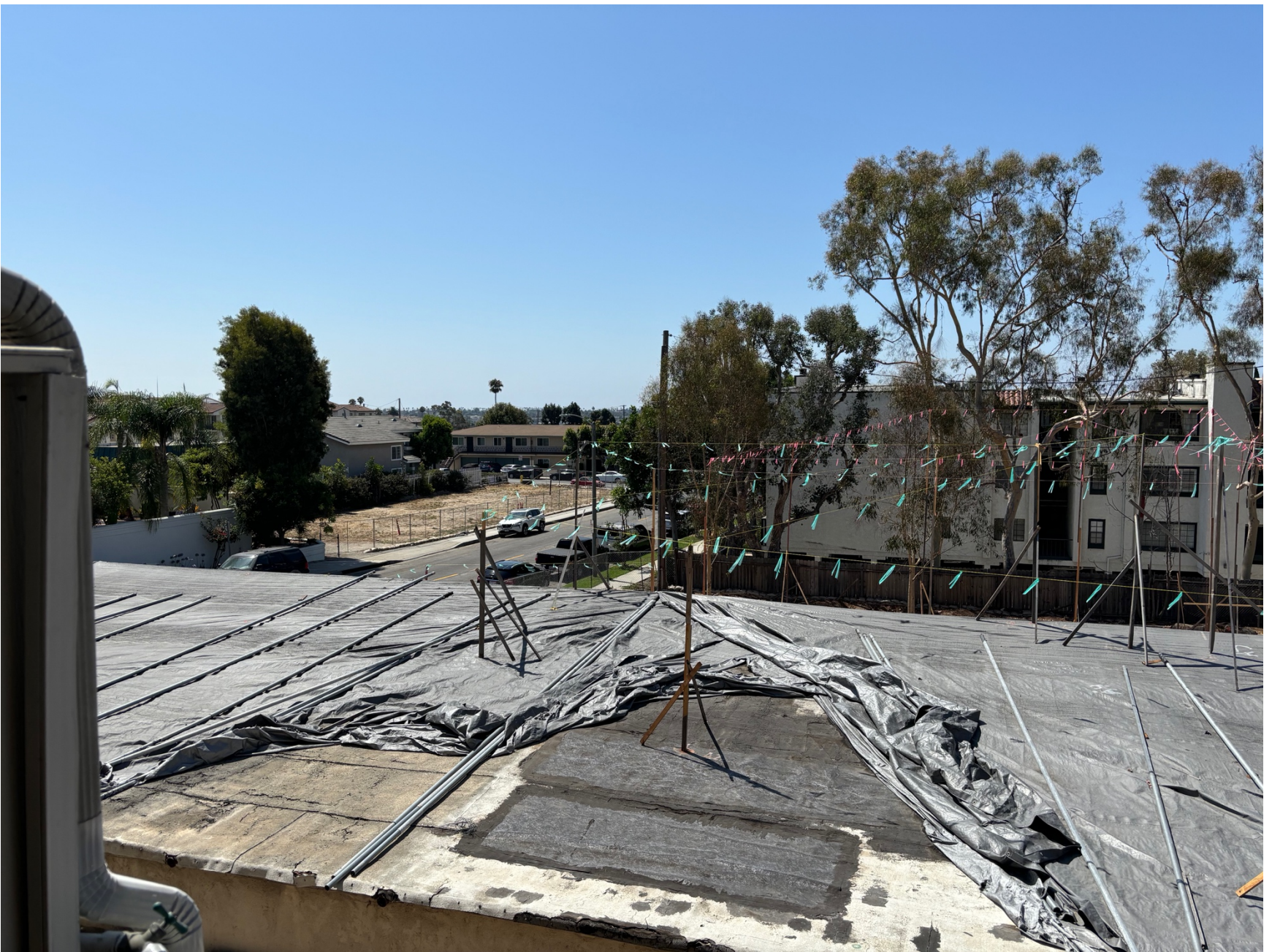
Balcony (sitting down)