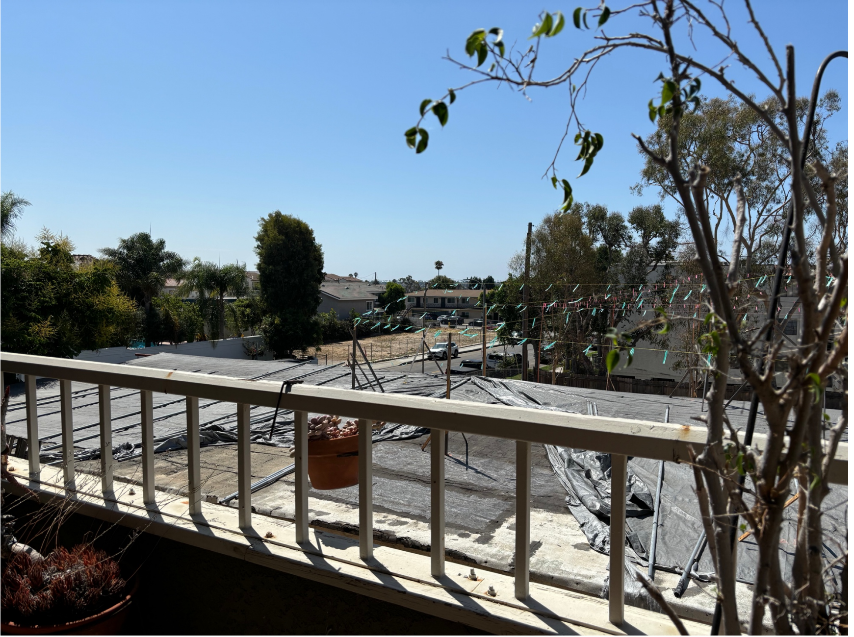
Balcony (sitting down)