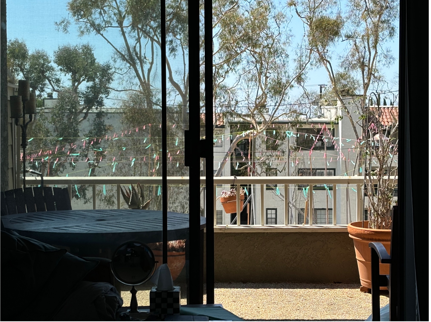
Living Room (standing up)